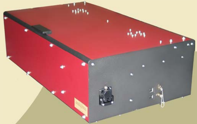
Avoca SP-30 SPIDER system