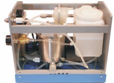
Dye circulation unit

CW narrow-band combined Ti:Sapphire/Dye laser with intra-cavity frequency doubling, model TIS/DYE-FD-08, presents the optimal cost-efficient solution for a source of radiation tuneable within a wide range of wavelengths important for spectroscopy of semiconductor materials and other tasks. The output radiation wavelength range of the laser is 570-950 nm (570-700nm/Dye and 700-950nm/Ti:Sa) for the fundamental harmonics and 285-425 nm for the second-harmonics, the radiation line width being 0.05-0.01 nm depending on the installed selective elements.